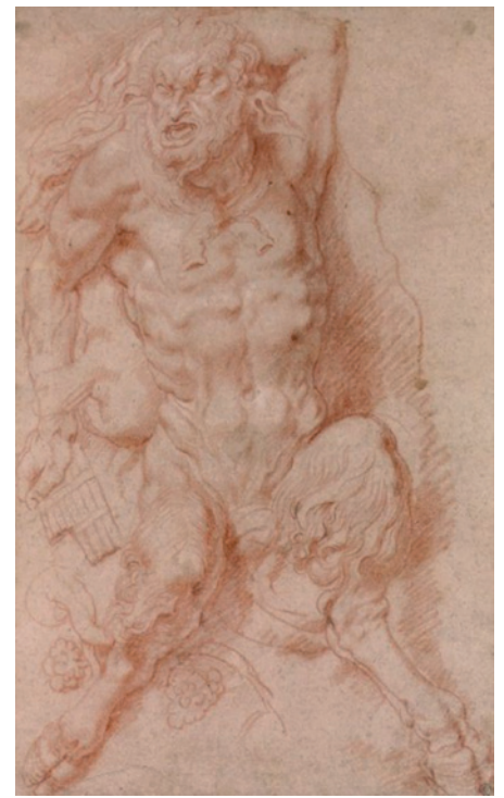
Rubens, A sleeping Pan