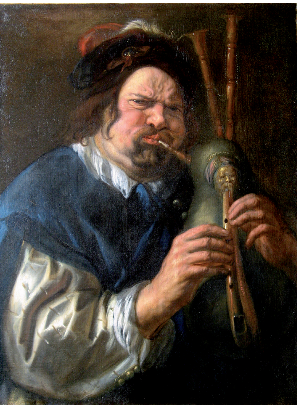
Jacob Jordaens The Bagpipe Player .

The Rubenshuis, which has a small but interesting ensemble of seventeenth-century Flemish masters, recently added a rarity to its collection: a genre piece painted by Jacob Jordaens around 1640–45. The painting was purchased in December 2009 at a London sale by the Courtin–Bouché Fund and given on long-term loan to the Rubenshuis, where it will be on display from 9 November as part of the permanent collection. What makes The Bagpipe Player special is that we recognize in this painting the artist himself, albeit with some difficulty. The same man, passionately making music, figures in a small number of other paintings by Jordaens, beginning with the splendid version of ‘As the old sing, so twitter the young’ now in the Musée des Beaux–Arts in Valenciennes. In addition to this painting, which is generally dated slightly earlier than The Bagpipe Player , there are at least three works by the master (or his studio) in which the same visage is recognizable.