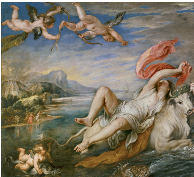
Rubens after Titian, The rape of Europa Madrid, Museo Nacional del Prado.