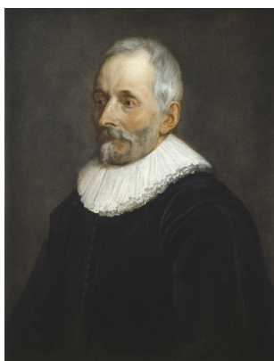
Jean-Baptiste Greuze (1725–1805) Portrait of the Young Florent Joseph van Ertborn