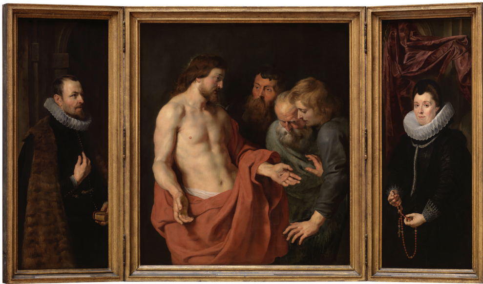
Peter Paul Rubens (1577–1640), Memorial Triptych of Nicolaas Rockox and his Wife Adriana Perez. The central panel shows the Incredulity of Thomas.