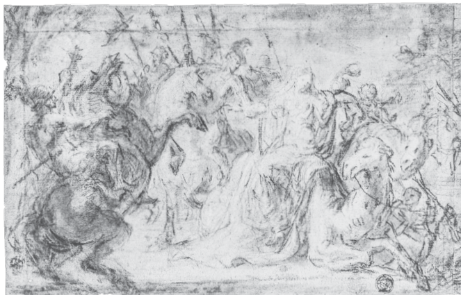
Justus van Egmont, Zenobia Surrounded by Mounted Soldiers . The Art Institute of Chicago

Next to being a court painter and academician, Van Egmont was also renowned in the Cercle des Précieuses in Paris, a most famous company inspired by Madame de Rambouillet. The court culture influenced by Baldassare Castiglione's (1478–1529) Il Cortegiano , which Maria de' Medici had brought with her, certainly was a determining factor. The fancy galanteries and whimsical badinages in these salons were practised by illustrious members such as Mesdames de Sévigné, Scudéry and Longueville. Famous beauties, some of them painted by Van Egmont, were praised in poetic descriptions by the ladies. This symbiosis of