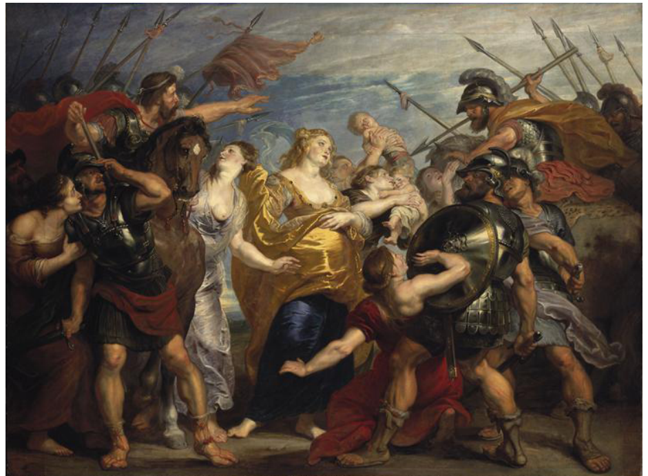
Rubens, The Reconciliation between Romans and Sabines . Alte Pinakothek, Munich

the course of his career. He died in 1674 and was buried in Antwerp's glorious St James's Church.