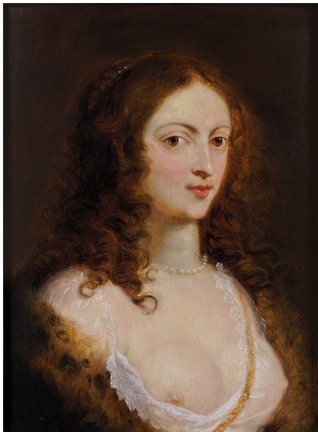
Erasmus Quellinus the Younger, Portrait of a Young Woman. Private collection, Antwerp

In presenting fifty or so of his most emblematic works, this first retrospective exhibition sets out to restore Erasmus Quellinus to his rightful place in the fascinating history of painting in the seventeenth century, transcended by the overwhelming art of Rubens. The exhibition lasts until 7 September. For opening hours see www.museedeflandre.lenord.fr .