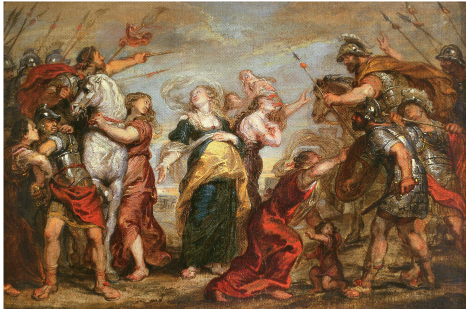
Justus van Egmont, The Reconciliation between Romans and Sabines . Rubenshuis, Antwerp

From 1650 onwards he signed some of his paintings and documents with 'Justus Verus d'Egmont'. This can be connected with his claim to nobility as a descendant of the famous house of Egmont. A general trend in the early modern period was the upward social mobility of the bourgeoisie, whose ultimate aspiration was to be raised to peerage. A position in royal service was also a sure way to move upward, 'Omdat den Constgeern bij den ryckdom is' (Because art covets the company of wealth), as Karel van Mander had written. Some artists cleverly used their networks to climb the social ladder, and the embodiment of this phenomenon was right in front of Van Egmont, who obviously wanted to compete with Rubens, both in the social and the artistic field. Although Van Egmont is documented in the Leiden archives as the son of a carpenter, he is known to have amassed a sizeable capital invested in real estate in