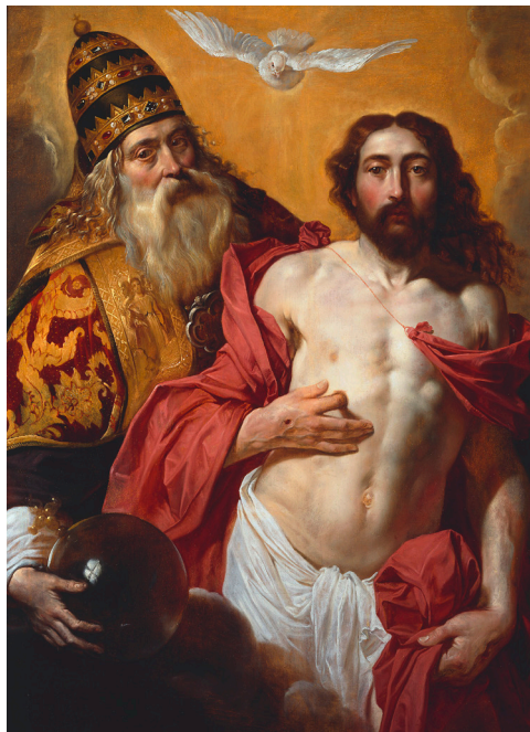
Artus Wolffort, The Holy Trinity , Kunsthandel Mühlbauer