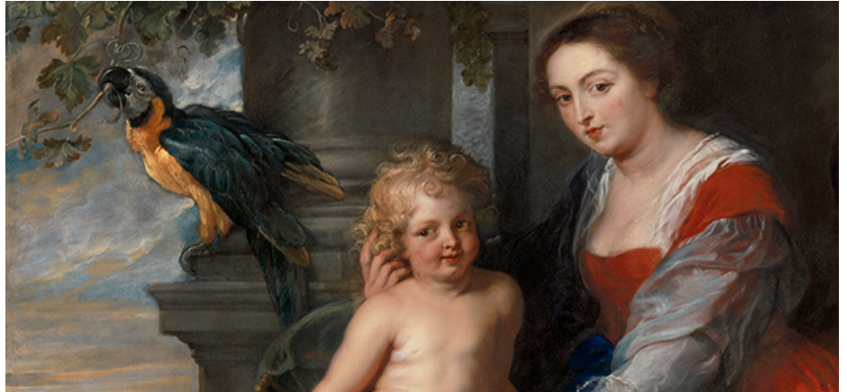
Peter Paul Rubens, The Holy Family with the Parrot (detail). Koninklijk Museum voor Schone Kunsten, Antwerp

For opening hours, see www.museummayervandenbergh.be