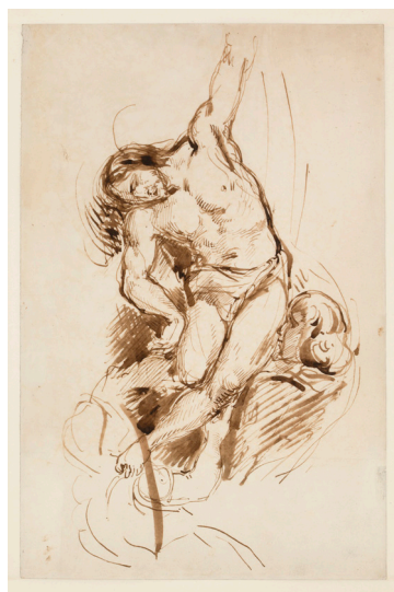
Eugène Delacroix, Descent from the Cross , c. 1839. Pen and brush and brown ink on paper, 32.2 x 21.1 cm. Museum Boijmans Van Beuningen, Rotterdam (Koenigs Collection)

The exhibition is on until 4 January. All information on www.bozar.be