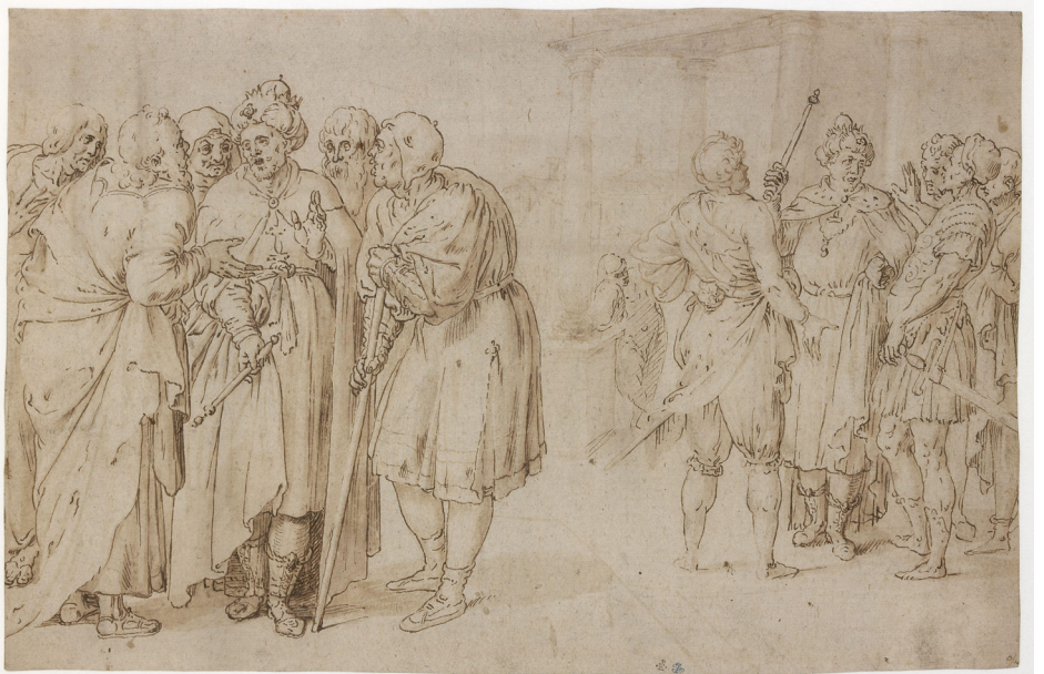
Ambrosius Francken, The Deliberation of King Roboam .