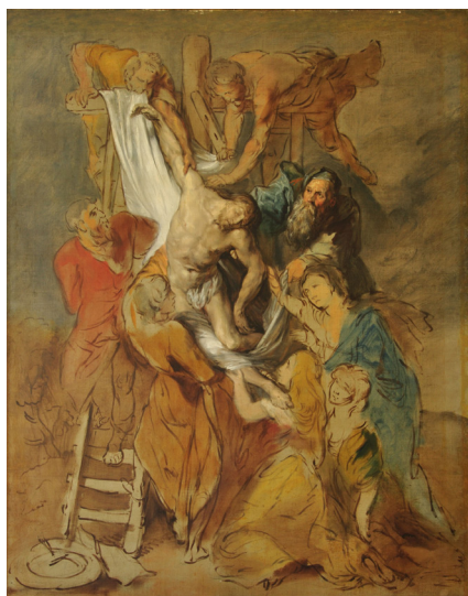
Thomas Gainsborough, Descent from the Cross, 1766–69. Oil on canvas, 125.5 x 101.5 cm. Gainsborough's House, Sudbury

Of course, as always, there is an element of truth in these commonplaces. Rubens's works are sensational, loud and sometimes violent. But he is also a sensitive painter in his informal and tender family portraits and a poetic one in his Gardens of Love , his landscapes and his pastoral scenes with peasants dancing. That kind of painting has rarely been shown, and yet it had the greatest impact on his artistic heirs. In such works Rubens was the precursor of Rococo, Romanticism and Impressionism.