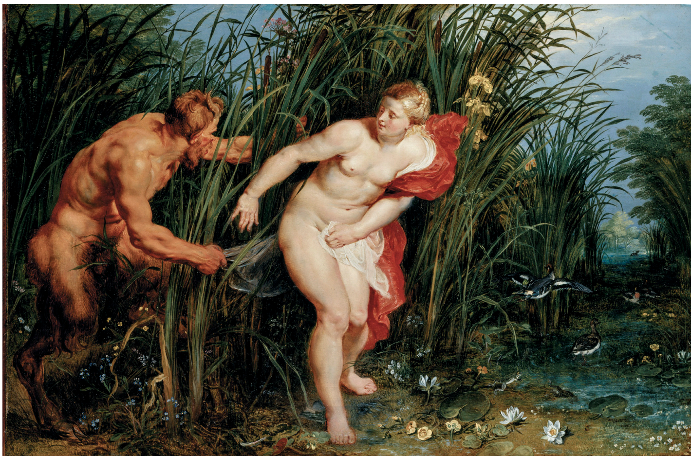
Peter Paul Rubens, Pan and Syrinx, 1617. Oil on panel, 40 x 61 cm. Staatliche Museen, Kassel

much frivolity and nakedness. In New York's renowned Frick Collection, Rubens is absent because of the supposed immorality of his oeuvre. The well-known and recurring criticism on his voluptuous ladies, on the other hand, was precisely the reason for some other artists to admire him. The French criticized his drawing, while Rubens used his unsharp contours purposefully to create atmosphere and depth.