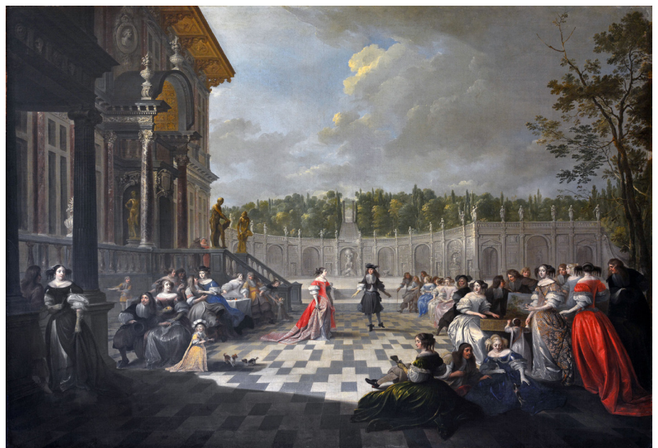
Hieronymus Janssens, Merry Company on a Palace Terrace , c. 1668–70. Private collection

The lecture is in Dutch and will take place at the Rubenianum.