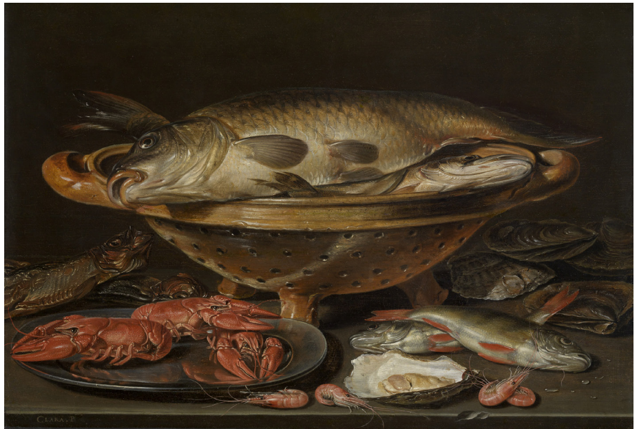
Clara Peeters, Still Life with Fish , Koninklijk Museum voor Schone Kunsten, Antwerp.

The lecture is in Dutch, max. 55 people. Entrance is free (museum ticket required)