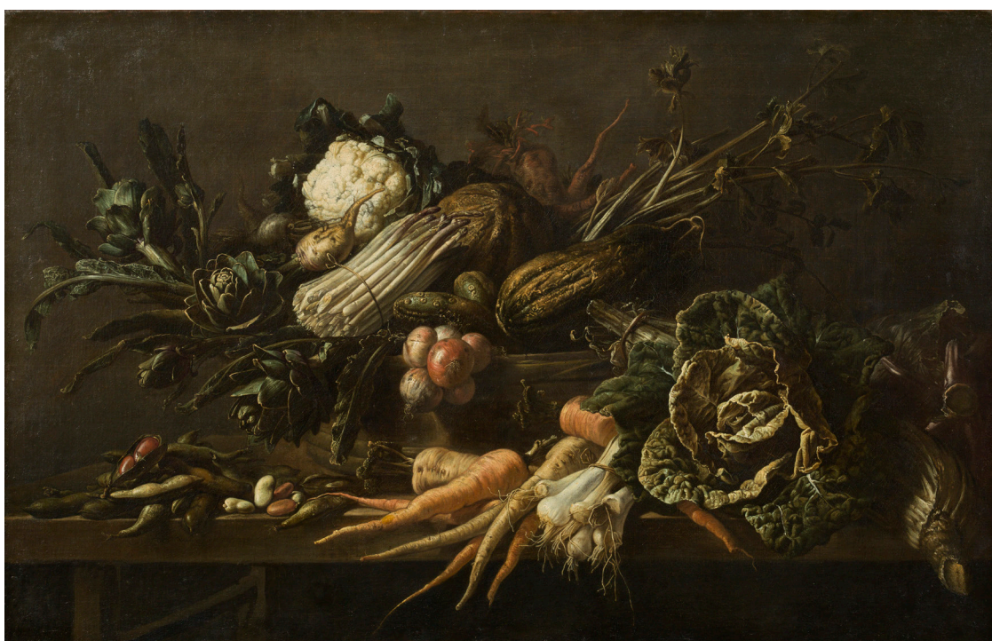
Fig. 4 Adriaen van Utrecht (1592–1652). Still Life of Vegetables . Oil on canvas, 75.9 × 119.4 cm. Private collection, Grand Duchy of Luxemburg