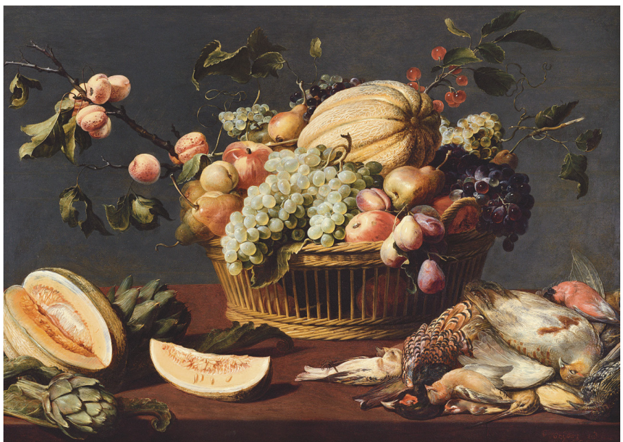
'Cokeryen': Frans Snyders, Still Life . Rockoxhuis, Antwerp

Antwerp in his studio, he took up the artistic challenge of drawing designs for expensive showpieces, the execution of which he left to young, talented sculptor friends, such as the German Georg Petel (1601/02–1634) and the Flemings Artus Quellinus I (1609–1668) and Lucas Faydherbe (1617–1697). A scientific publication, the first ever dedicated to this subject, will accompany the exhibition.