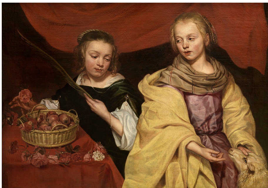
Michaelina Wautier, Two Girls Presented as Saint Agnes and Saint Dorothea . Koninklijk Museum voor Schone Kunsten Antwerp, inv. 599