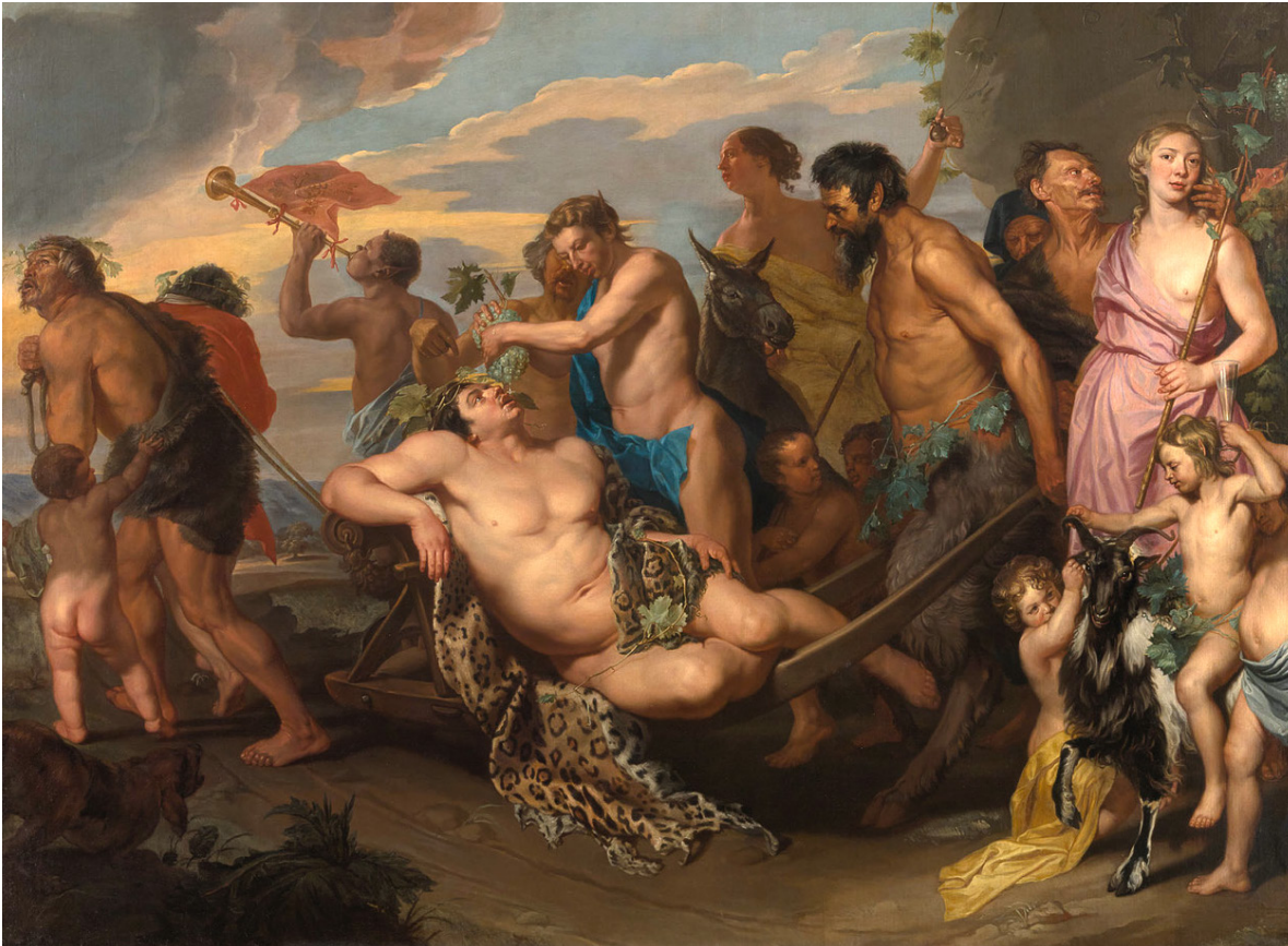
'Michaelina': Michaelina Wautier, Bacchanal . Kunsthistorisches Museum, Vienna

contemporary design of chasubles. DNA analyses are being carried out in Rubens's burial chapel in the hope of making his biography even more complete... A walk past these churches immerses the visitor in a wonderful world of fine arts, inspiration and admiration.