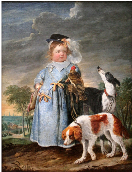
Erasmus Quellinus II and Jan Fijt, Boy with falcon and two dogs , c. 1650–55. Royal Museum of Fine Arts, Antwerp

Since 2014 the Rubenianum has been acquiring the extensive research archive of art historian Dr Jean-Pierre De Bruyn on Erasmus Quellinus II. In 2018, the digital inventory will be fully accessible. This completion seems to be the perfect occasion to present a status quaestionis as well as address new questions on the Quellinus family – a booming business in seventeenth-century Antwerp – and their designs for various artistic disciplines, such as sculpture, book illustrations and applied art.