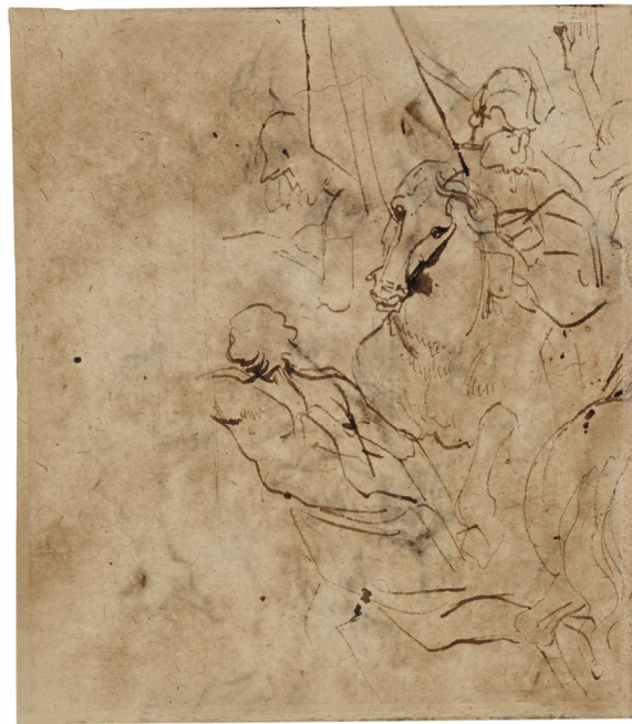
Figs. 1-2 Anthony van Dyck, Figure studies for an equestrian battle , c. 1618–21. Pen and brown ink, framing lines (recto) in pen and black ink, 100 × 87 mm. Private collection. Reproduced (actual size) with kind permission of the owner.