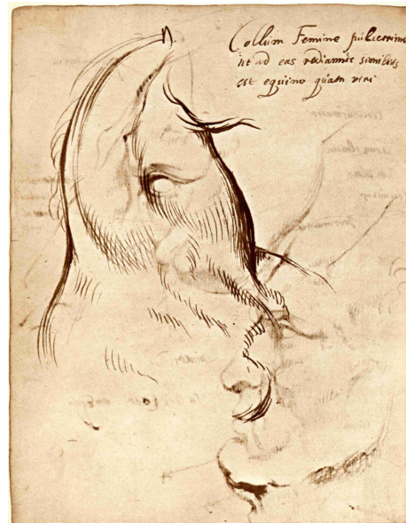
Fig. 4 Attributed to Anthony van Dyck, Study of the neck of one of the 'Horses of Monte Cavallo' , c. 1616–17. Pen and brown ink, 210 × 160 mm, fol. 66v of the 'Chatsworth Manuscript', The Devonshire Collection, Chatsworth.