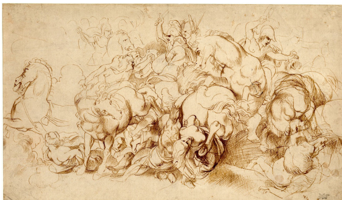
Fig. 3 Peter Paul Rubens, The Battle of the Amazons , c. 1600–03. Pen and brown ink over traces of graphite or black chalk, 251 × 428 mm. The British Museum, London.