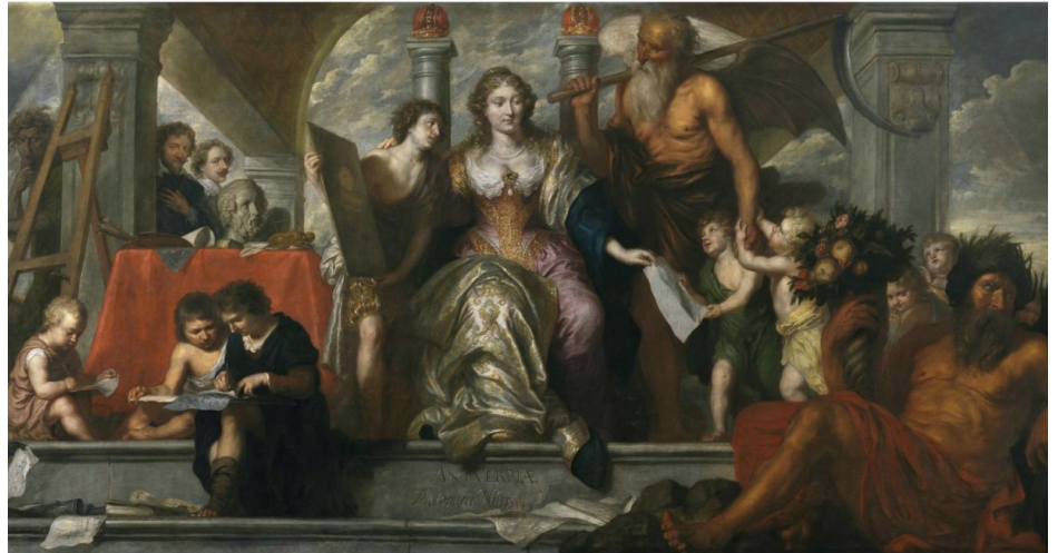
Theodor Boeyermans, Antwerp Nourishing the Painters , 1663–65 (detail). Royal Museum of Fine Arts, Antwerp