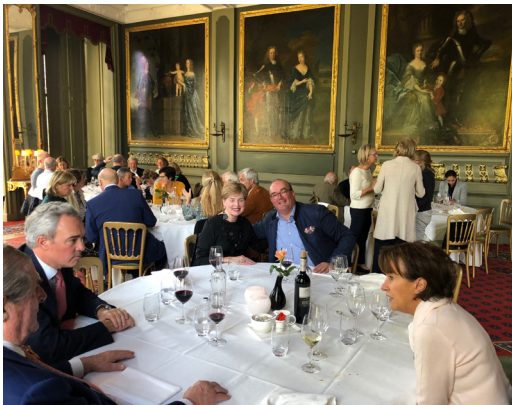
Lunch in Duivenvoorde Castle's dining room designed by Daniel Marot.