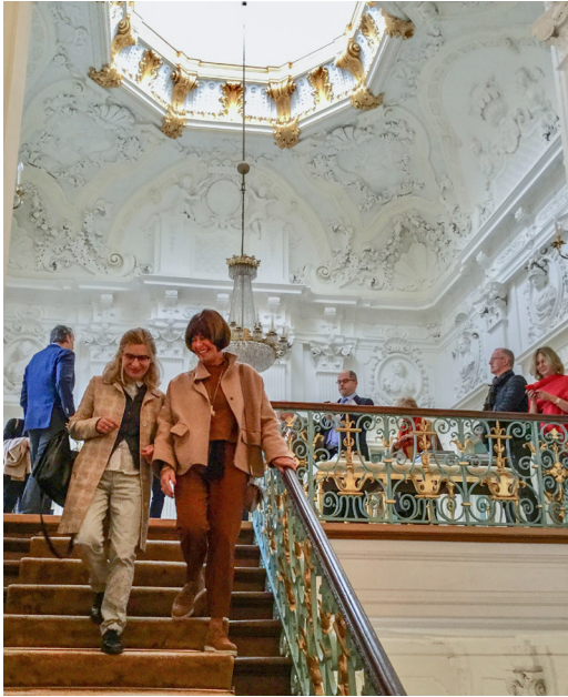
Huis Schuylenburch, residence of the German ambassador, The Hague.