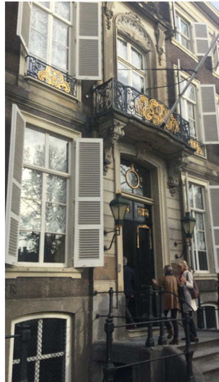
Visiting the Hoogsteder gallery, The Hague.