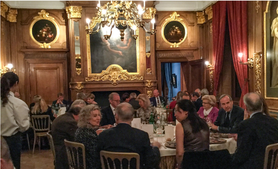
Dinner in the Golden Room at the Mauritshuis, The Hague