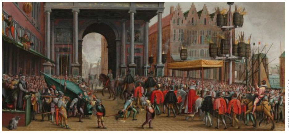
Monogrammist MHVH, Joyous Entry of the Duke of Anjou in Antwerp on 19 February 1582. Oil on panel, 61.5 × 82.5 cm. Rijksmuseum, Amsterdam, sĸ-A-4867.

This Study Day, held at the Rubenianum, is postponed to early December 2020 due to the current travel restrictions. Further information will follow as soon as possible. Current ticket holders will be contacted via email.