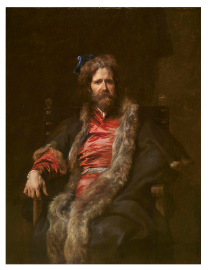
Fig. 7 Anthony van Dyck, Marten Ryckaert , c. 1630. Oil on canvas, 148 × 113 cm. Museo Nacional del Prado, Madrid.

and the micrographer and performer Matthias Buchinger, to whom a thrilling exhibition was devoted in the Metropolitan Museum in 2016. Other recent projects have focused on the print collection of London's Royal College of Physicians or on a single portrait of a severely disabled man in Schloss Ambras. A further exhibition at Bremen's Haus der Wissenschaft was the result of a research project led by Dr Cordula Nolte. These projects are often the fruit of a collaborative effort involving academics, curators and community activists. Though perhaps not suited for a blockbuster show, these often modestly-sized images prove the continuing relevance of art of the early modern period to contemporary audiences. They, and the stories they hold, can touch our visitors in ways a masterpiece perhaps could not.