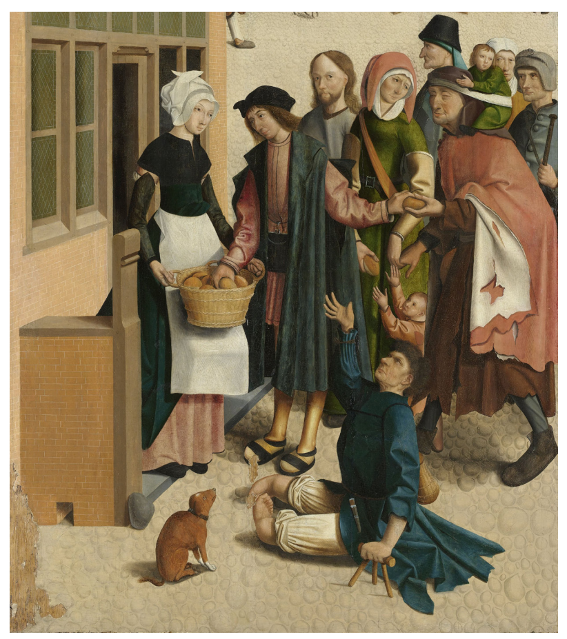
Fig. 4 Master of Alkmaar, The Seven Works of Mercy, Feeding the Hungry (detail), 1504. Oil on panel, 101 x 54 cm. Rijksmuseum, Amsterdam.

Representations of people with a disability with which art historians are more familiar, tend to be the products of that cultural construct, as Henri-Jacques Stiker has shown in a trailblazing 1982 study. They show people with a disability as amusing decorations in the margins of illuminated manuscripts or as crooks who fake a limp or a hump to fool unwitting citizens into handing out alms.