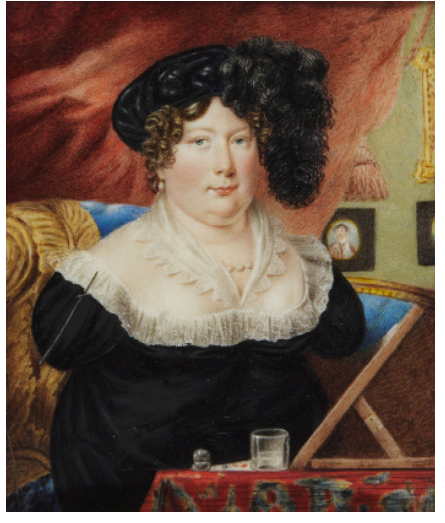
Fig. 5 Sarah Biffen, Self-Portrait , c. 1821. Watercolour and body colour on ivory, 124 × 103 mm. Sotheby's London, 5 December 2019, lot 365.

a unique contribution to make by calling attention to a broad and diverse visual discourse on disability and to an admittedly smaller yet important group of historic representations of and by individual people with a disability. Moreover, by tracing the careers of artists with a disability, they can shift attention from disability to ability. Rudi Ekkart's 2014 exhibition Deaf, Dumb & Brilliant. Johannes Thopas, Master Draughtsman added a Dutch name to a growing list of rehabilitated artists such as the calligrapher Thomas Schweiker