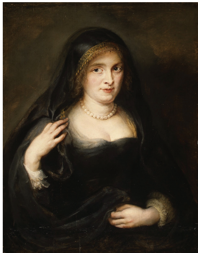
Peter Paul Rubens, A Woman with a Veil (Helena Fourment?) , c. 1630–35. Panel, 76.8 × 60 cm. The Metropolitan Museum of Art, New York