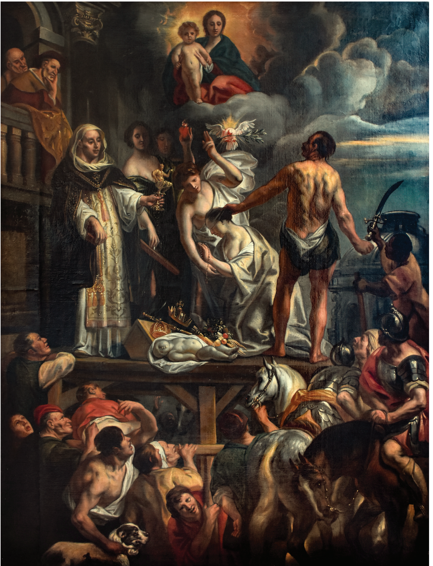
Fig.1 Jacques Jordaens and studio, The Martyrdom of Sts Cyricus and Julitta . Canvas, 178.5 × 133.5 cm. Private collection