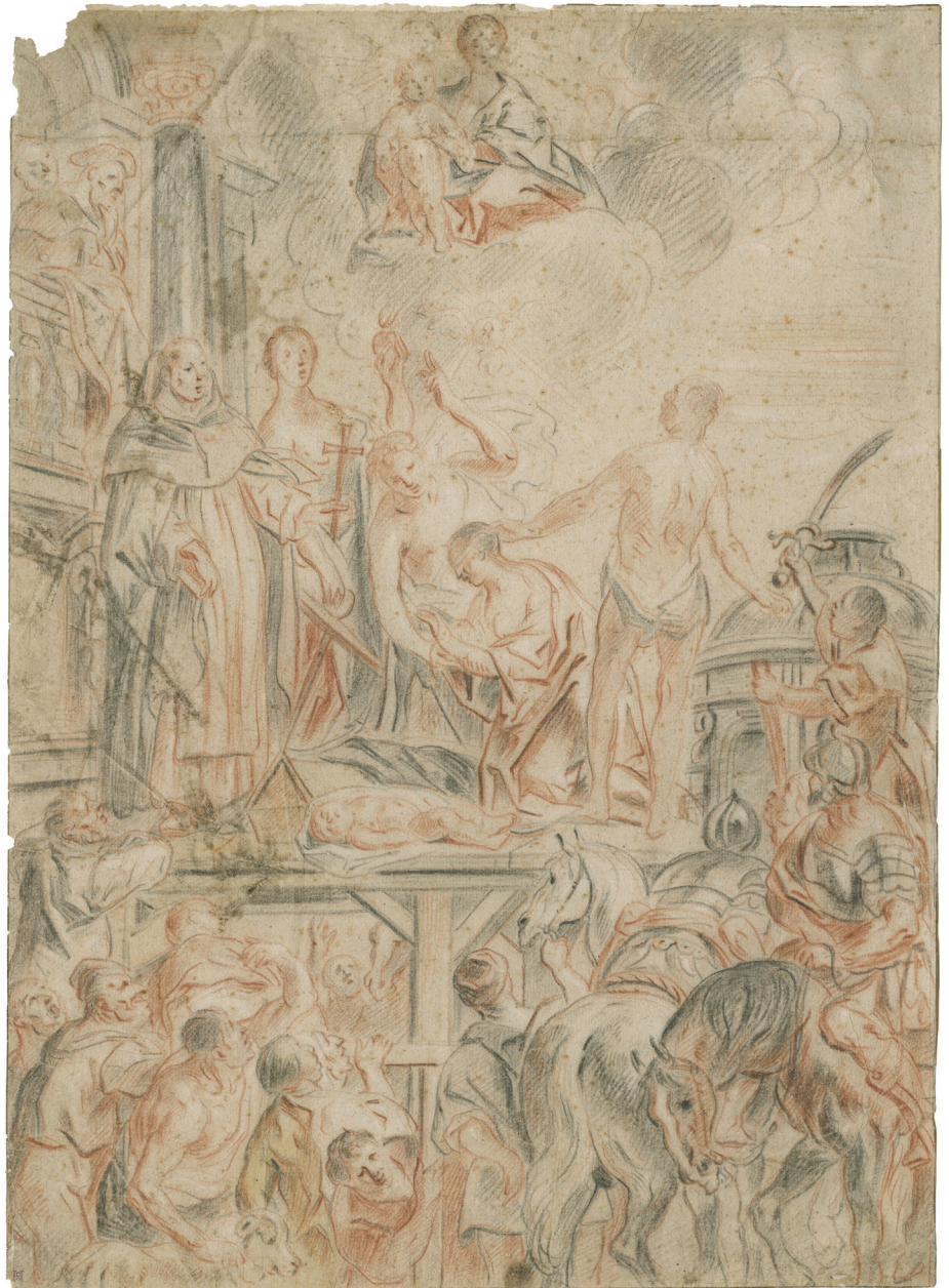
Fig. 2 Attributed to Jacques Jordaens, The Martyrdom of Sts Cyricus and Julitta , drawing. Museum Plantin-Moretus, Antwerp, PK.OT.00166

its subject as Sts Cyricus and Julitta, and likewise believed it to be the painting from Oosterhout.