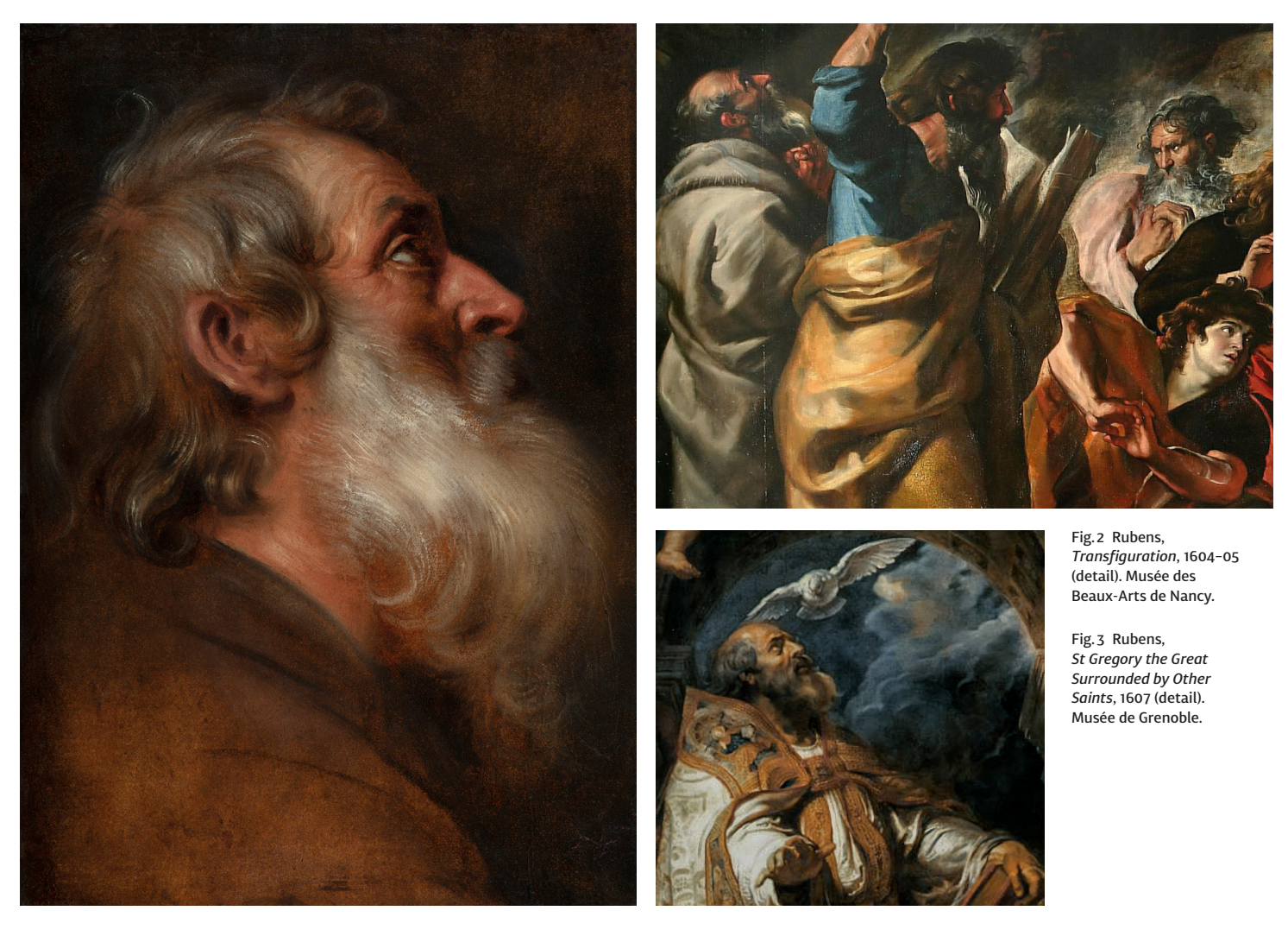
Fig.1 Rubens, Head of a Bearded Man, Facing Right and Gazing Upwards , c. 1604. Oil on paper, mounted on panel (tinted lime wood?),<sup>1</sup> 39.6 \times 28.3 cm.

One of the most fascinating aspects of Rubens's varied studio practice is his systematic use of head studies. The nearly sixty surviving ones have recently been catalogued by Nico Van Hout,<sup>2</sup> but there must have been many more, for now and then another one surfaces.